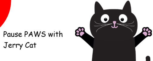
Pause PAWS with Jerry Cat

Reflection Questions Ask me this- What are you worried about moving to Year 1? Tell me something you really enjoyed doing this year.