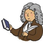
Samuel Pepys starts to record the unfolding events in his diary.