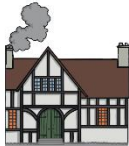
The fire starts at Thomas Farriner's bakery in Pudding Lane.