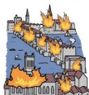
People carry their possessions to safety using boats on the River Thames.