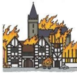
As news of the fire spreads, people run to escape from its path.